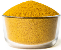
Corn Fermented Protein